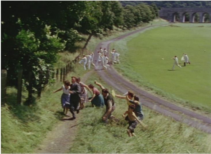
Cricket field at Monkton Combe