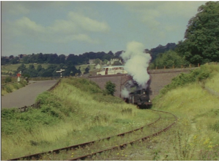
Between Limpley Stoke and Monkton Combe Notice the bus in exactly the same place in "today's" view.