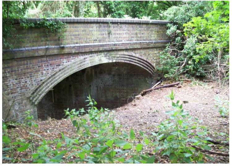
Between Midford and Combe Hay