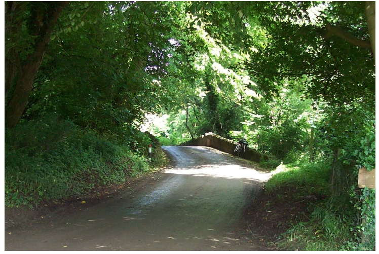
Splott Bridge, near Dunkerton Colliery