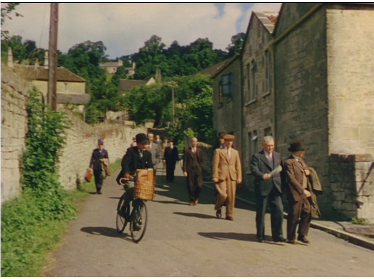
Mill Lane and Monkton Combe Station