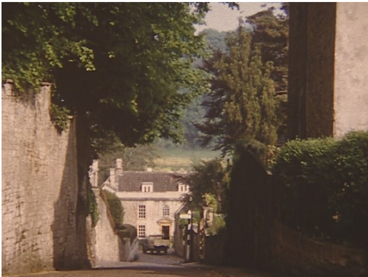
The Hill, Freshford