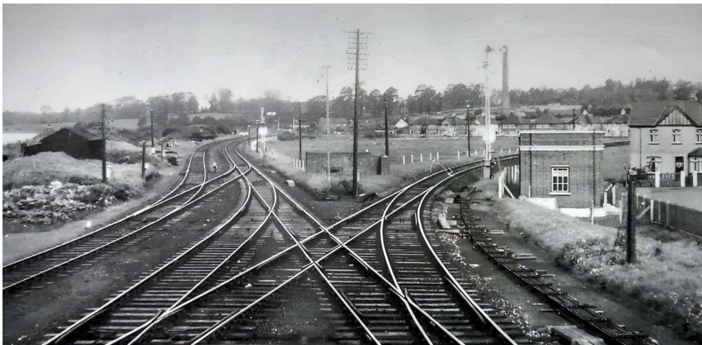
The Hartopp Road Sewage Pumping Station at right, above, remains a distinctive building today and is just visible in the trees below.